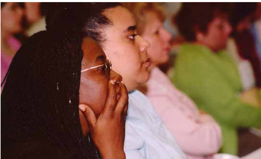
About 350 teachers learned ways to help children who are victims of trauma at The Melissa Institute for Violence Prevention's annual conference.